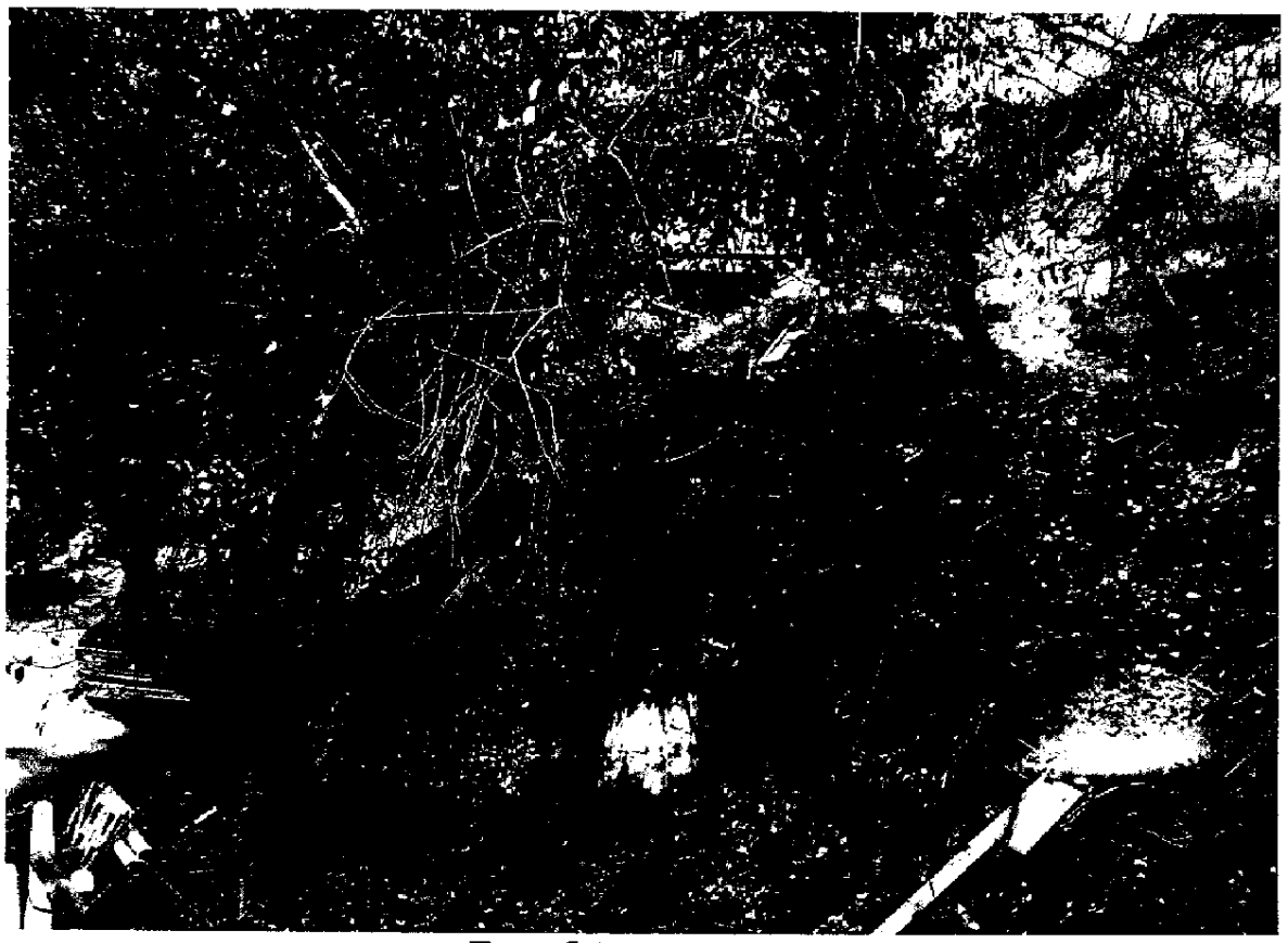
Tree 6 (American Elm)