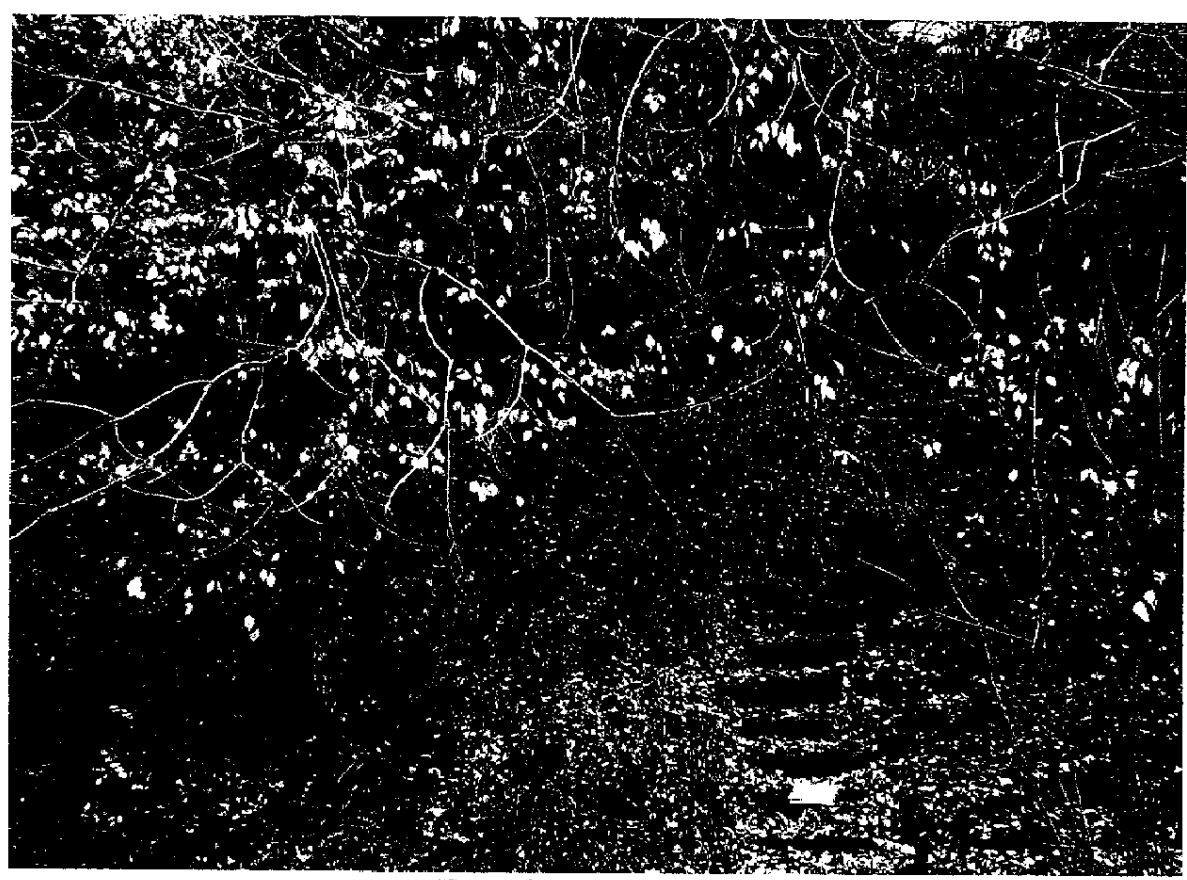
Tree 9 (American Elm)

Jan 29 07 01:03p Jeffrey 310.584.9384 p.11