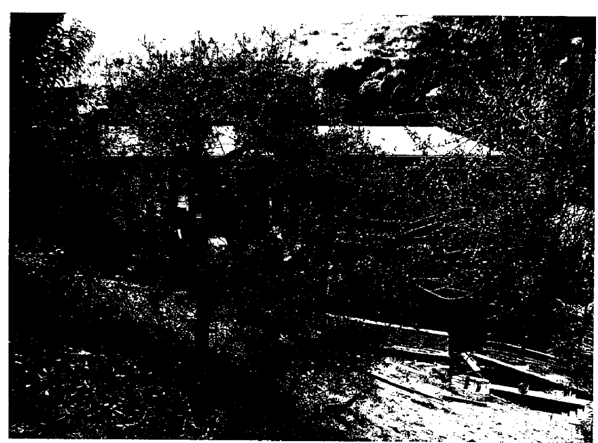
Tree 7 (Scrub Oak)

Jan 29 07 01:01p Jeffrey 310.584.9384 p.10