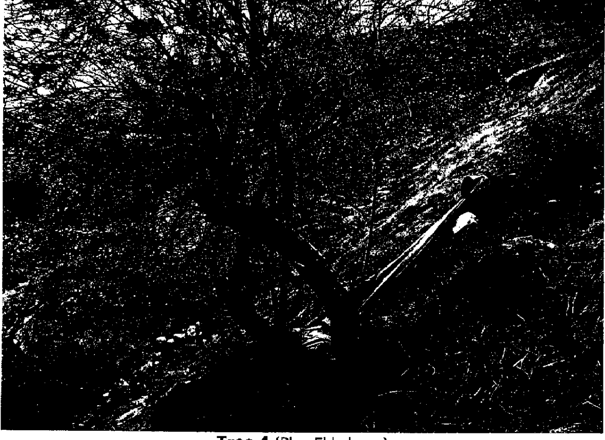
Tree 4 (Blue Elderberry)