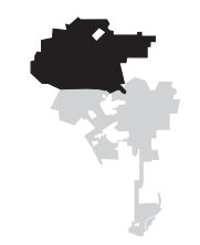
Figure 3-4 Long Range Land Use Diagram San Fernando Valley