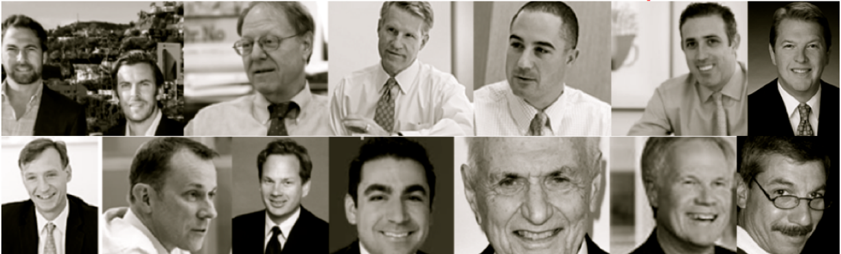
The Townscape/Angelo Gordon (Beverly Hills and New York money) 8150 team. Pictured: Developers, Architect, Attorneys, Lobbyists and Media Representative.