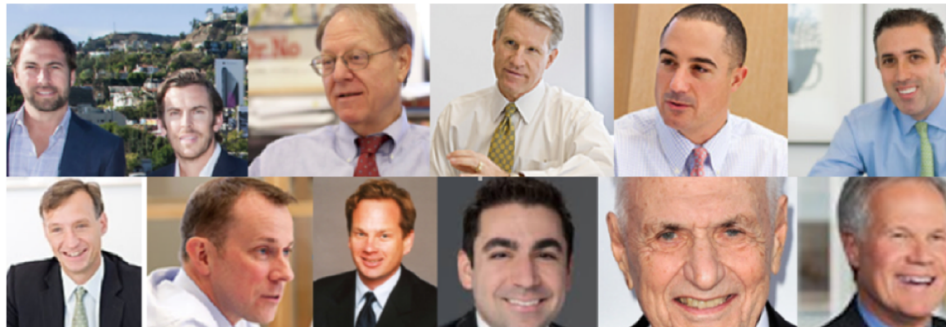
The Townscape/Angelo Gordon (Beverly Hills and New York money) projects team. Pictured: Developers, Architect, Attorneys and Lobbyists.

Does their "Jim Crow" style of thinking represent the values and diversity that represents West Hollywood and Los Angeles in considering their 8899 Beverly Blvd and 8150 Sunset proposed developments?