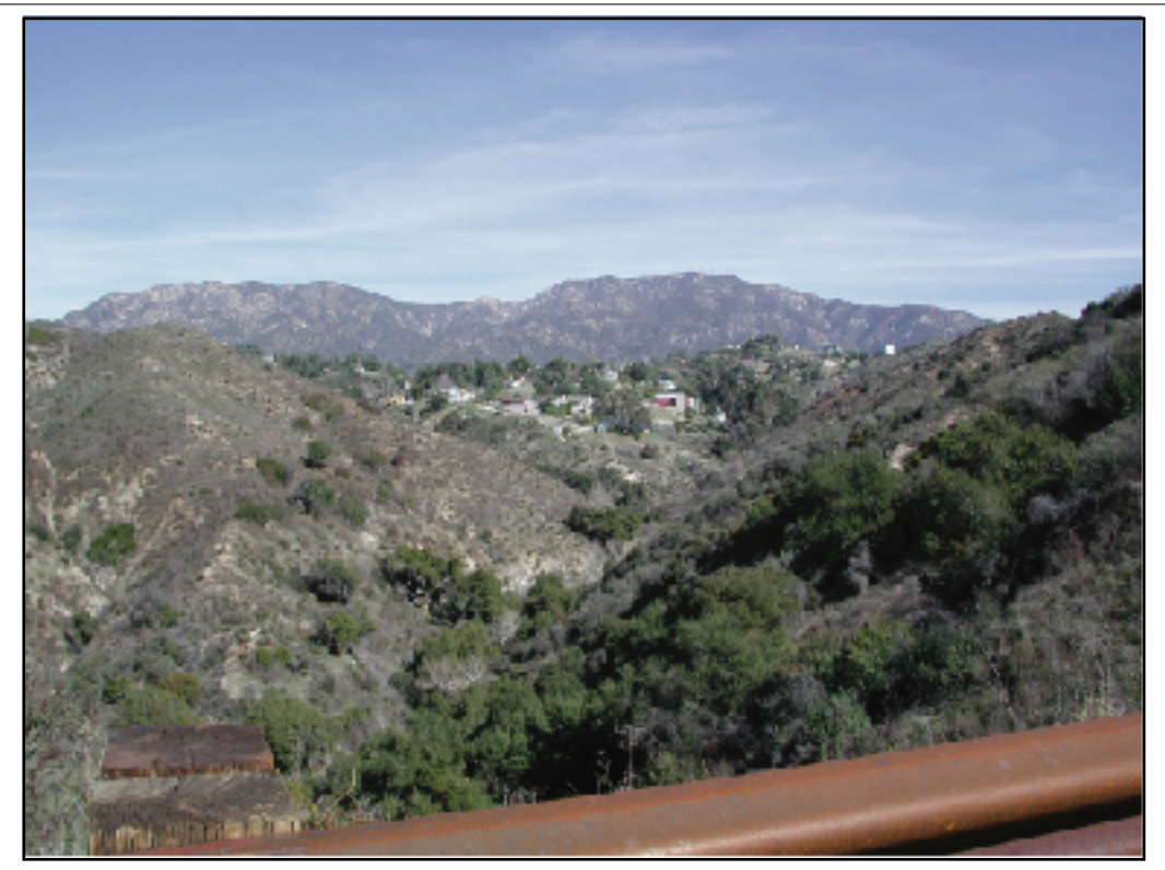
Photograph A: View from Interstate 210 looking northeast into Development Area A, with existing adjacent residences in the middle ground.