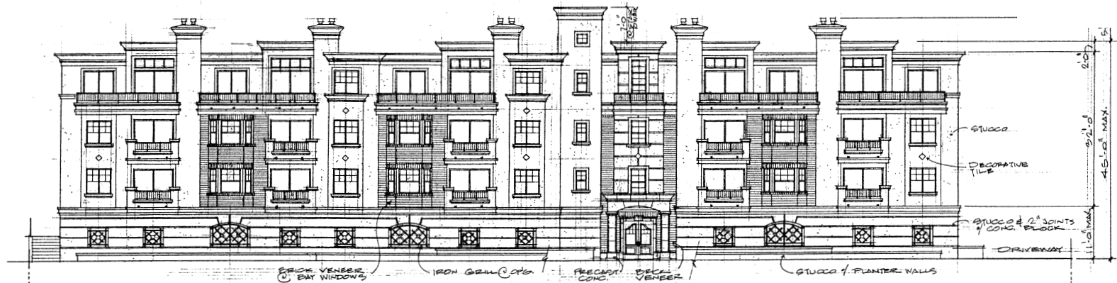
SOUTH ELEVATION (FACING MAGNOLIA) SCALE: 1/8"=1'-0"