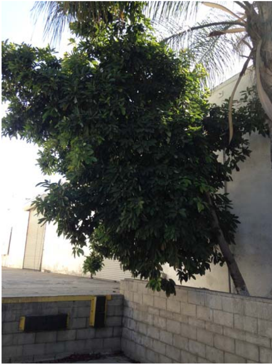
Figure 3: Avocado (Tree 5) on the east side of 1100 E 5 th St.