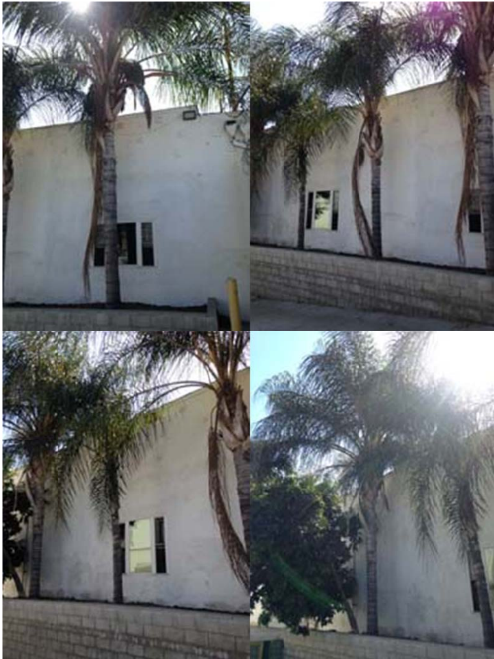
Figure 2: Four queen palms (Trees 1-4) on the east side of 1100 E 5 th St.