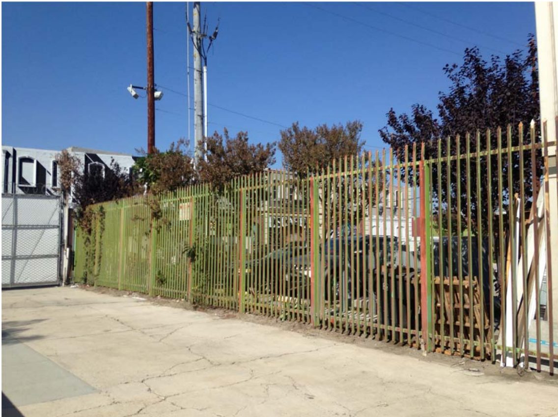
Figure 4: Trees growing on eastern side of property line at 1100 E 5 th St including Purple Leaf Plum and Crape Myrtle.