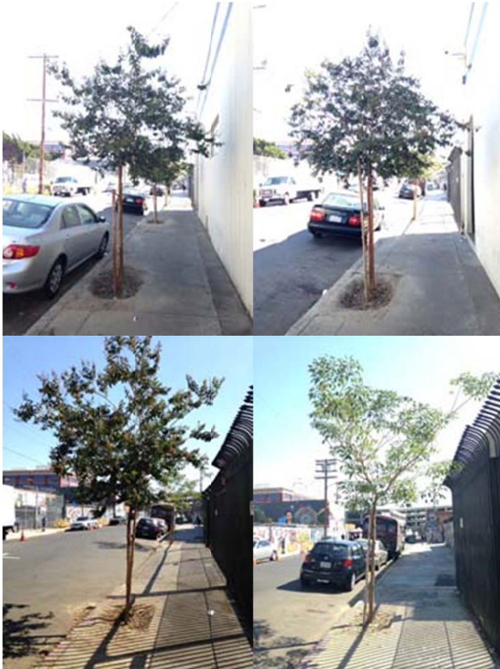
Figure 3: Four crape myrtles (Trees 5-8) on the eastern side of 676 Mateo