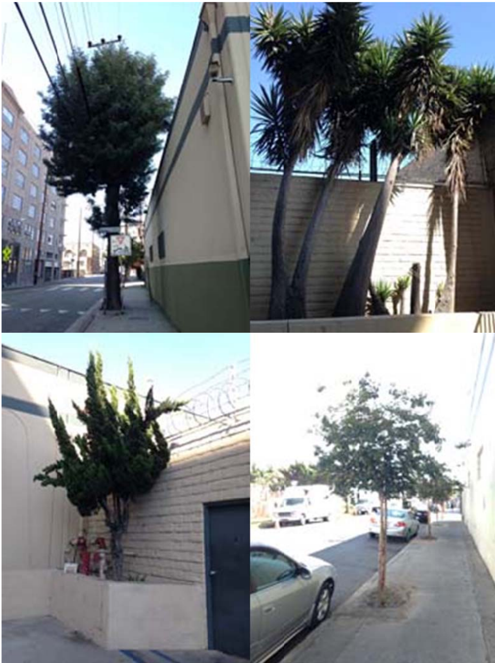
Figure 2: (Clockwise from top left) Tree 1 Silk Oak, Tree 2 Yucca, Tree 4 Crape Myrtle, and Tree 3 Juniper at 676 Mateo