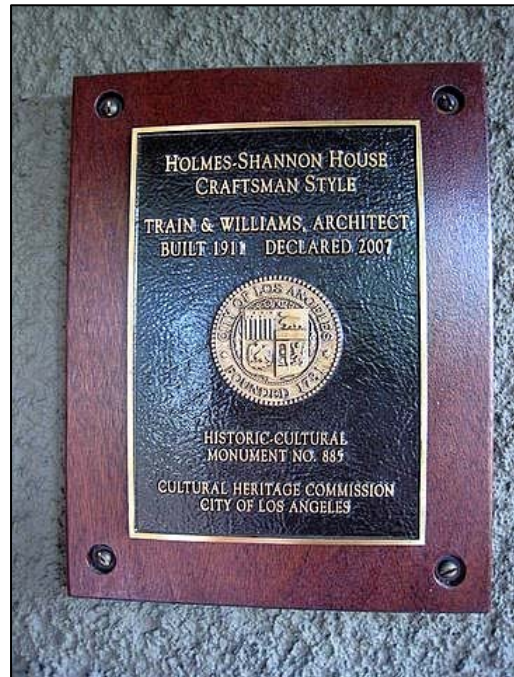
Historic-Cultural Monument Plaque

In some instances, a Monument may not warrant the listing of the builder if it is unknown; or the architectural style if the resource is a landscape feature (e.g. tree, rock, etc.). There may also be multiple architects associated with a resource and it may be more appropriate to list the firm name of the architect and not specific individuals associated with the project. Many of these types of plaque requests are handled on a case-by-case basis.