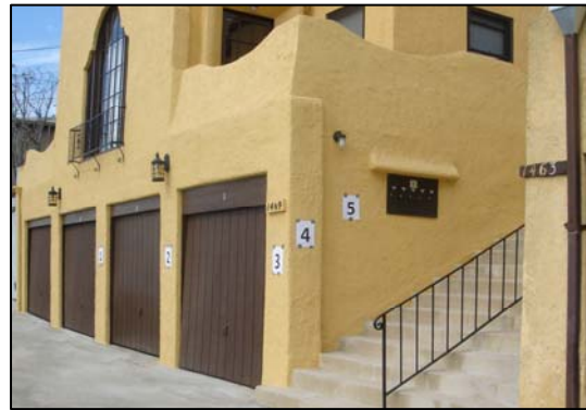
Example of plaque location mock-up

The artwork is sent to the City for review and approval by the Cultural Heritage Commission. The applicant shall also e-mail to the plaque coordinator a digital photograph indicating the desired installation location of the plaque. The location shall be approved by the Commission and/or the Office of Historic Resources to ensure visibility by the public and compatibility with the Monument.