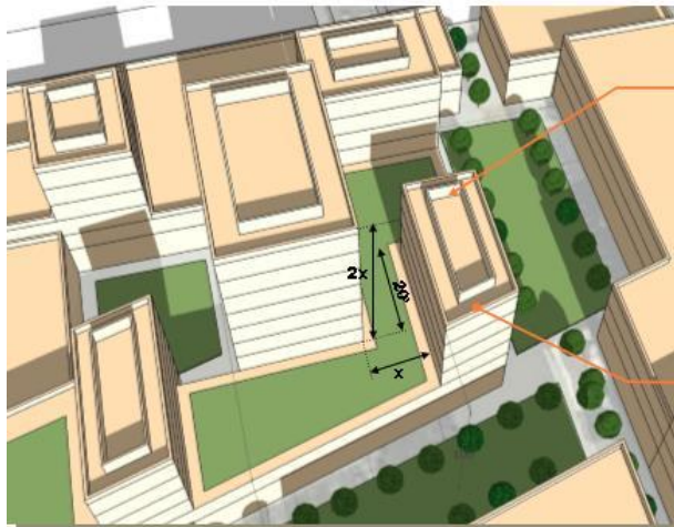
Parcel Group "A" Tower Footprint Standards:

Towers 75 feet in height or greater that face onto other towers of equal or greater height for a length of 20 feet or more shall be distanced from one another one (1) foot for every two (2) feet in height.