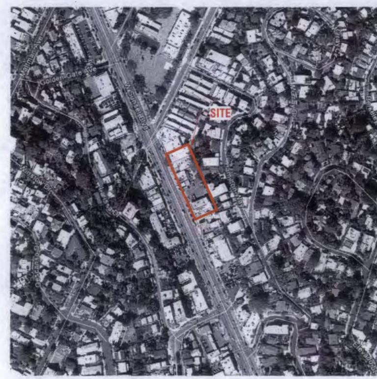
EXHIBIT "A" Page No. 1 of 22 Case No. D12-2019-1957-Tpc-SPR

SCALE: 0' 8' 16' 32' COVER SHEET | 02/25/19